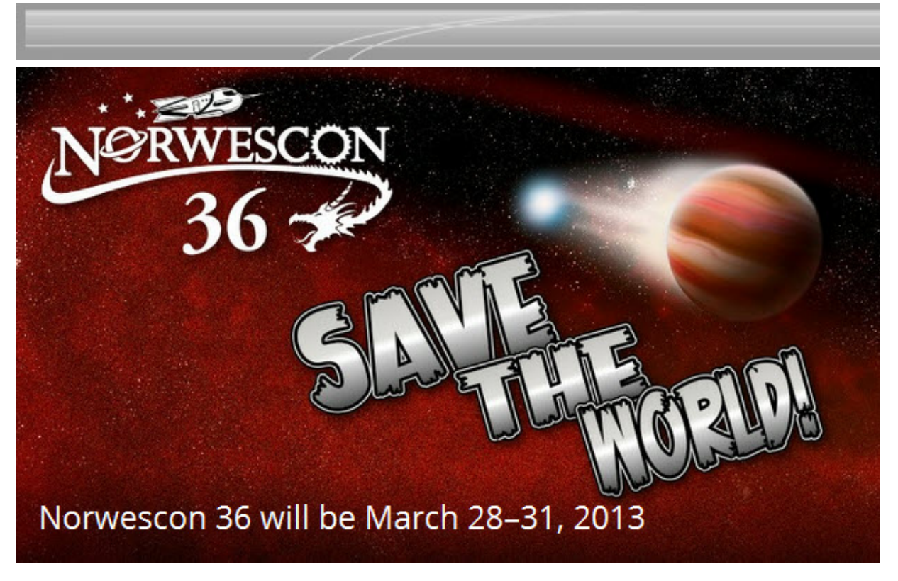
eNewsletter - October 201

You may unsubscribe if you no longer wish to receive our emails.